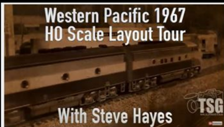
#WesternPacific #HOscaleLayout Western Pacific 1967 HO Layout Tour with Steve Hayes WP