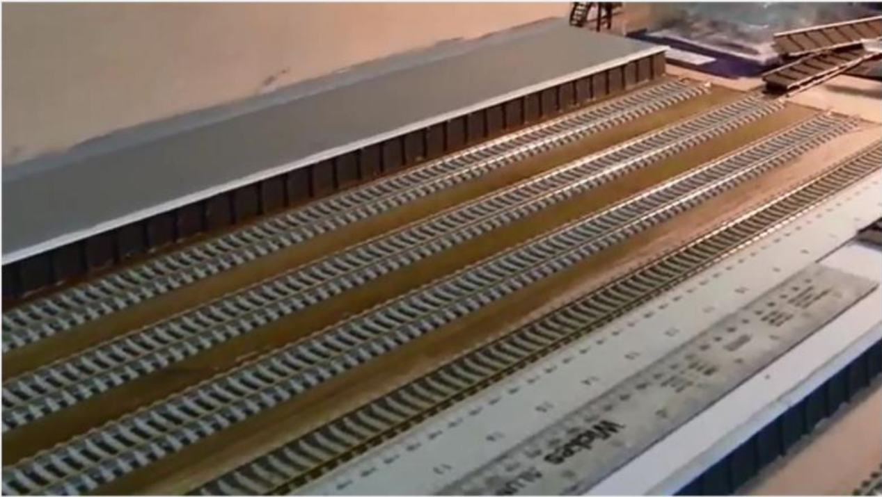
HOW TO BUILD STATION PLATFORMS.