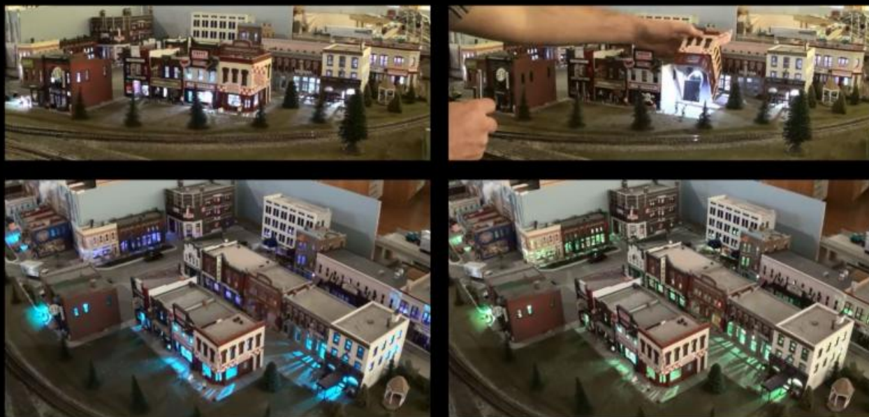
OMRA Pixel Lighting Using an Arduino Trinket Board

Kathy shows how to plan and prep a location to include various terrain features that will help highlight the additional effects she'll create in subsequent episodes.