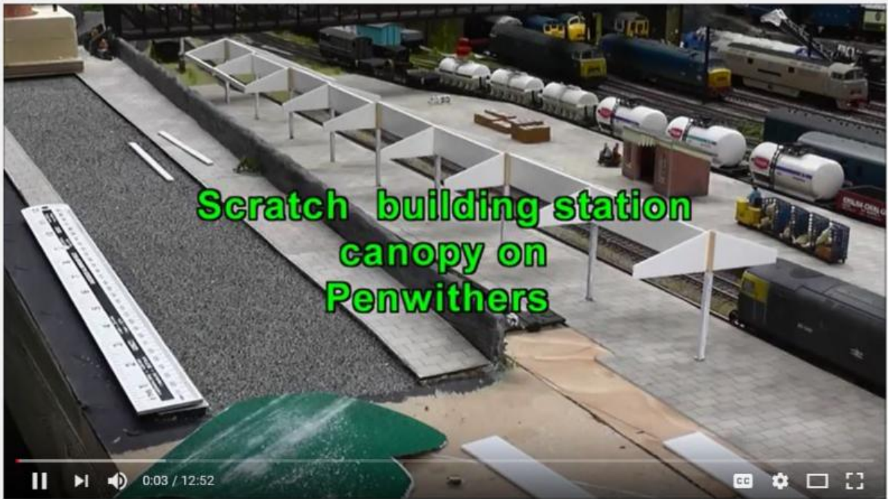
Scratch building station canopy on Penwithers