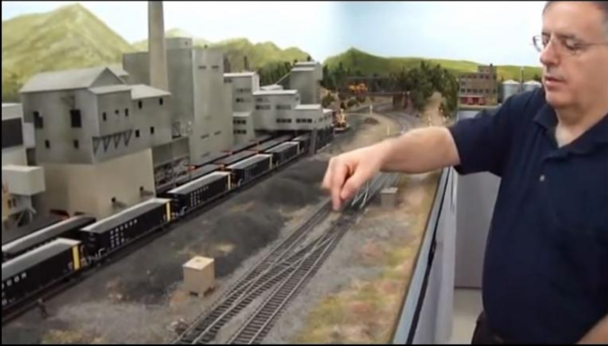
Helpful Hints for Operating Model Railroads Pt 1, Visiting a New Layout