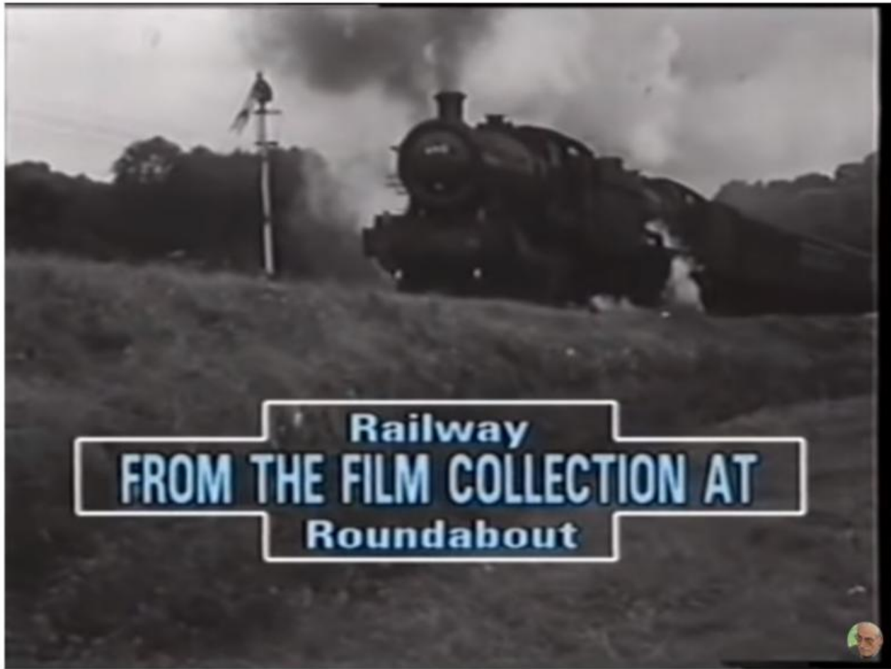
RAILWAY ROUNDABOUT - BBC TV SERIES 1961