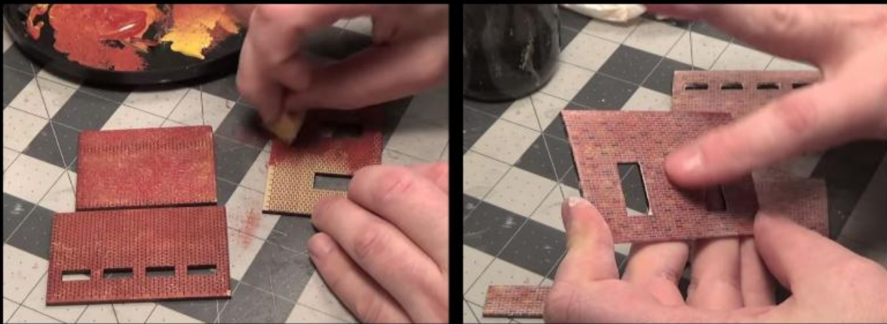
Painting Brick Walls

In this video the presenter looks at the equipment you would need like cameras, mics, and software to make your own YouTube videos.